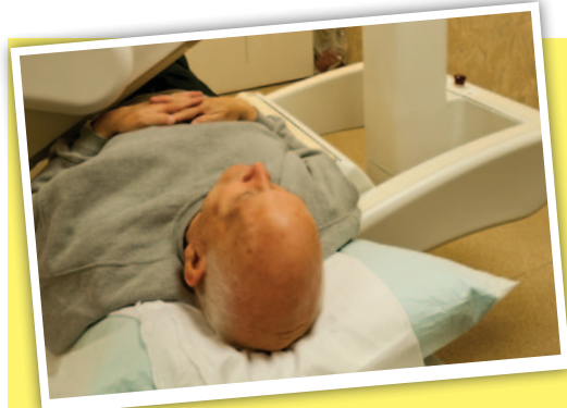
Cancer medical malpractice claim. See p. 1.

This publication is intended to educate the general public about personal injury, medical malpractice, and other issues. It is for information purposes only and is not intended to be legal advice. Prior to acting on any information contained here, you should seek and retain competent counsel. The information in this newsletter may be freely copied and distributed as long as the newsletter is copied in its entirety.